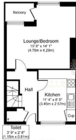
Ground Floor Approximate Floor Area 388 sq. ft. (36.0 sq. m.)