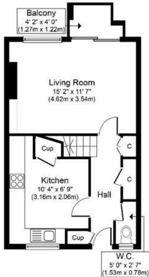
Ground Floor Approximate Floor Area 413 sq. ft. (38.4 sq. m.)